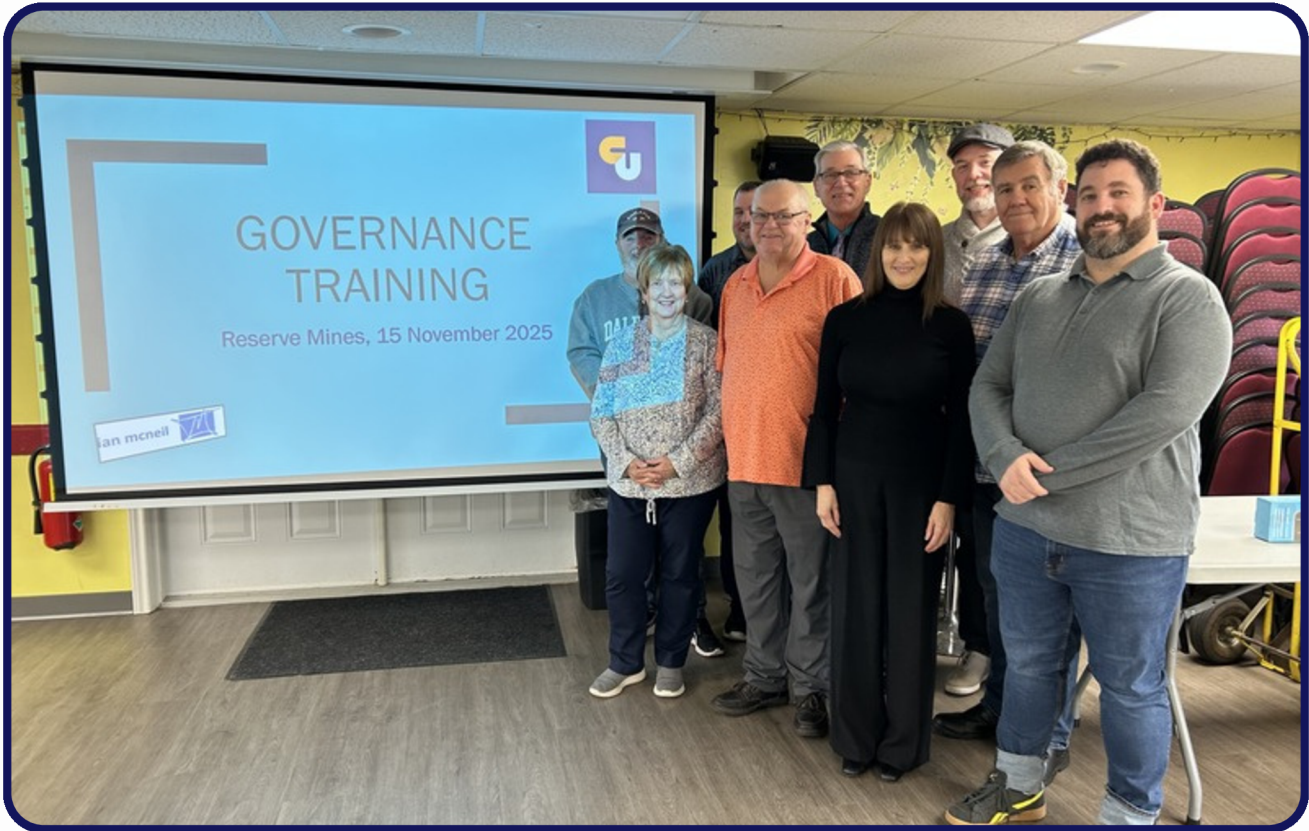
Above: In November 2025, our Board participated in Governance Training to reinforce best practices, accountability, and leadership for the benefit of our members.