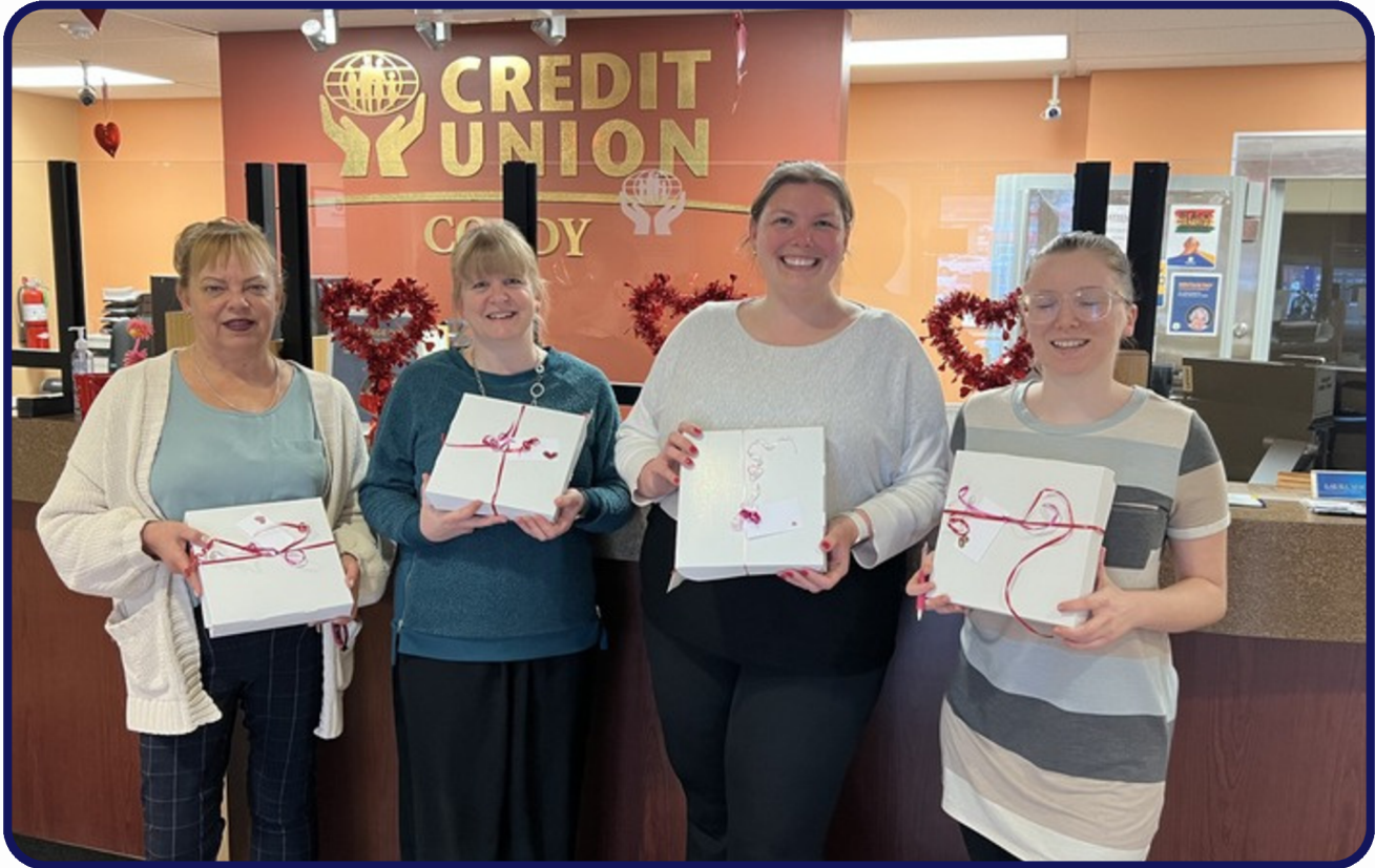
Above: Part of the Glace Bay staff with their Valentine's boxes purchased to support Horizon Achievement Centre.