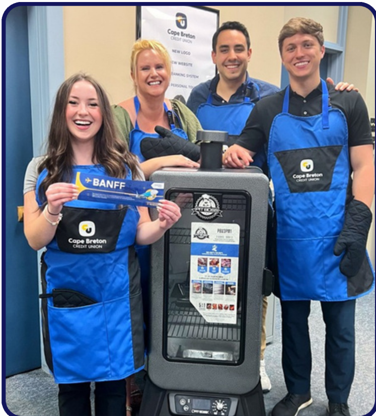
Left: Some staff members posing for a campaign in summer 2025.