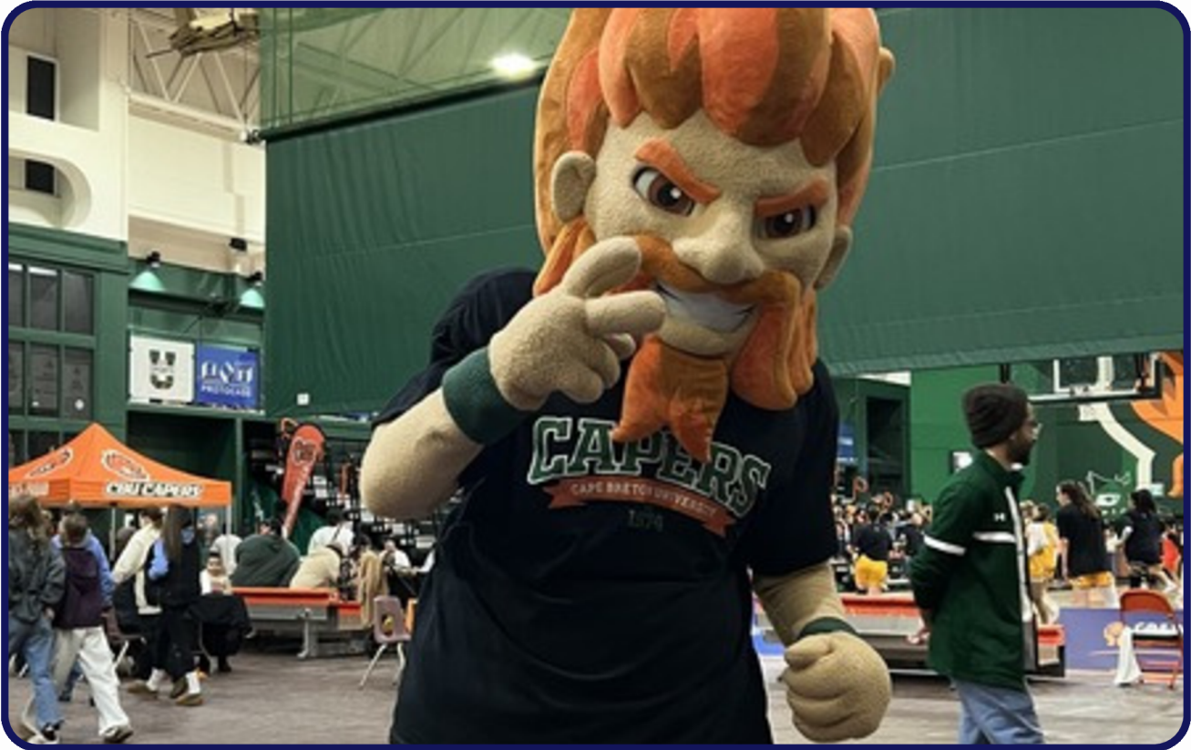
Above: CBU mascot posing for the CBCU camera during a CBU Athletics events we sponsor.