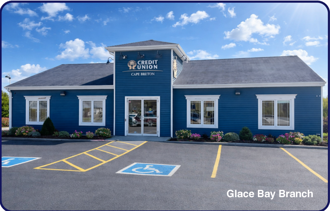
Glace Bay Branch